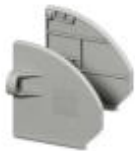
Flange cover, Color: gray