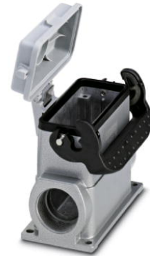
Figure shows product variant without screw connection

http://eshop.phoenixcontact.de/phoenix/treeViewClick.do?UID=1771684