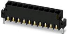
The figure shows the 10-position version

PCB headers, nominal current: 6 A, rated voltage (III/2): 160 V, number of positions: 12, pitch: 2.54 mm, color: black, contact surface: Gold, mounting: SMD soldering, Fixed coding of the last position, can be combined with the FMC 0,5/...-ST-2,54 C2 connector