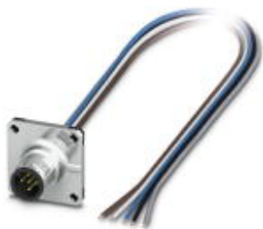
Sensor/Actuator flush-type plug, 5-pos., M12, A-coded, front/square flange mounting, with 0.5 m TPE litz wire, 5 x 0.34 mm 2

Please be informed that the data shown in this PDF Document is generated from our Online Catalog. Please find the complete data in the user's documentation. Our General Terms of Use for Downloads are valid ( http://phoenixcontact.com/download )