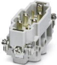
HEAVYCON plug insert, K4/2 series, for 4 power and 2 control contacts, screw connection, product with OEM logo

Please be informed that the data shown in this PDF Document is generated from our Online Catalog. Please find the complete data in the user's documentation. Our General Terms of Use for Downloads are valid ( http://download.phoenixcontact.com )