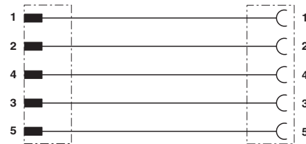
Contact assignment of the 7/8" connector and the 7/8" socket