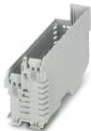
Component housing, length: 120.6 mm, Lower part, color: light gray, width: 37.6 mm, height: 57.7 mm

Please be informed that the data shown in this PDF Document is generated from our Online Catalog. Please find the complete data in the user's documentation. Our General Terms of Use for Downloads are valid ( http://phoenixcontact.com/download )