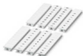
Zack marker strip, 10-section, horizontally labeled with the consecutive numbers: 41 ... 50, white, width: 5 mm

Please be informed that the data shown in this PDF Document is generated from our Online Catalog. Please find the complete data in the user's documentation. Our General Terms of Use for Downloads are valid ( http://phoenixcontact.com/download )