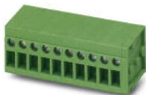
The illustration shows the 10-position version

Please be informed that the data shown in this PDF Document is generated from our Online Catalog. Please find the complete data in the user's documentation. Our General Terms of Use for Downloads are valid ( http://phoenixcontact.com/download )