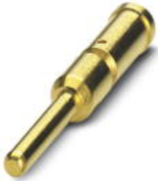
Crimp contact, turned, Contact diameter: 2 mm, Crimp range: 1.5 mm 2 ...2.5 mm 2

Please be informed that the data shown in this PDF Document is generated from our Online Catalog. Please find the complete data in the user's documentation. Our General Terms of Use for Downloads are valid ( http://phoenixcontact.com/download )