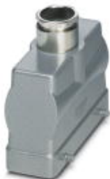
HEAVYCON B24 sleeve housing, for double locking latch, height: 76 mm, with 1 x Pg29 screw connection, straight cable outlet

Please be informed that the data shown in this PDF Document is generated from our Online Catalog. Please find the complete data in the user's documentation. Our General Terms of Use for Downloads are valid ( http://phoenixcontact.com/download )