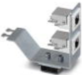
Patch field with two RJ45 CAT5e network connections

Patch panels - FL PF 2TX CAT5E - 2891165