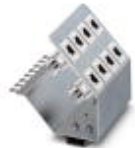
Patch field with eight RJ45 CAT5e network connections

Patch panels - FL PF 8TX CAT5E - 2891178