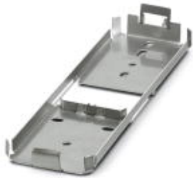
Mounting plate for Axioline E metal devices

Please be informed that the data shown in this PDF Document is generated from our Online Catalog. Please find the complete data in the user's documentation. Our General Terms of Use for Downloads are valid ( http://phoenixcontact.com/download )