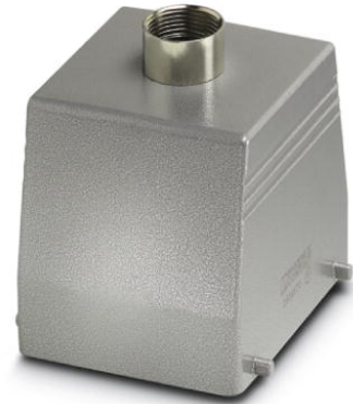
Photo shows sleeve housing with support

http://eshop.phoenixcontact.de/phoenix/treeViewClick.do?UID=1647307