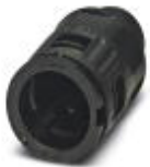
Cable gland, Pg thread, IP66 protection, straight