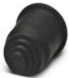
End sleeves, transition sleeves, from hose to cable

Transition sleeve from hose to cable - WP-EC TPE HF 13,0 BK - 3240975