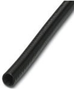
Polyamide protective hose, inflammability class V0, UV resistant

Please be informed that the data shown in this PDF Document is generated from our Online Catalog. Please find the complete data in the user's documentation. Our General Terms of Use for Downloads are valid ( http://phoenixcontact.com/download )