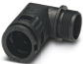
Cable gland, metric thread, IP66 protection, angled

Screw connection - WP-GA HF IP66 M12 BK - 3240924