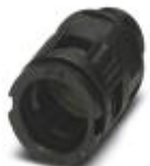
Cable gland, Pg thread, IP68/69k protection, straight