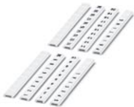
Zack Marker strip, flat, white, For terminal block width: 6.2 mm

Please be informed that the data shown in this PDF Document is generated from our Online Catalog. Please find the complete data in the user's documentation. Our General Terms of Use for Downloads are valid ( http://download.phoenixcontact.com )