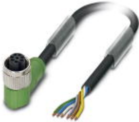
M12 socket, angled, 6-pos., with connected master cable, for sensor/actuator box with M8 slots, cable length: 10 m

Please be informed that the data shown in this PDF Document is generated from our Online Catalog. Please find the complete data in the user's documentation. Our General Terms of Use for Downloads are valid ( http://phoenixcontact.com/download )