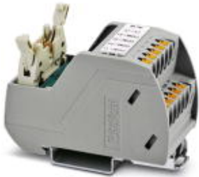
VARIOFACE Professional (VIP) board for the ROC800 controller

Please be informed that the data shown in this PDF Document is generated from our Online Catalog. Please find the complete data in the user's documentation. Our General Terms of Use for Downloads are valid ( http://phoenixcontact.com/download )