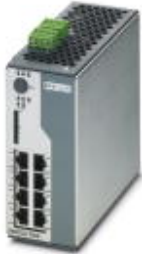
Managed Switch 7000 with eight 10/100 Mbit/s RJ45 ports for EtherNet/IP™

Please be informed that the data shown in this PDF Document is generated from our Online Catalog. Please find the complete data in the user's documentation. Our General Terms of Use for Downloads are valid ( http://phoenixcontact.com/download )