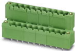
The figure shows a 10-pos. version with 20 contacts

Please be informed that the data shown in this PDF Document is generated from our Online Catalog. Please find the complete data in the user's documentation. Our General Terms of Use for Downloads are valid ( http://phoenixcontact.com/download )