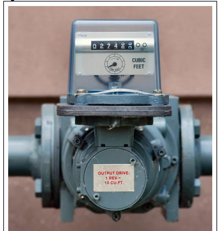
Figure 2. Natural Gas Meter

Install linear Hall-effect sensors in multiple locations inside the meter to detect the abnormal presence of a magnetic field. Send an alarm to the utility company or record this fraudulent activity in memory for processing at a later date.