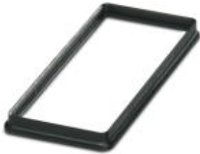
Profile gasket for sleeve housing type B16.....EEE

Please be informed that the data shown in this PDF Document is generated from our Online Catalog. Please find the complete data in the user's documentation. Our General Terms of Use for Downloads are valid ( http://phoenixcontact.com/download )