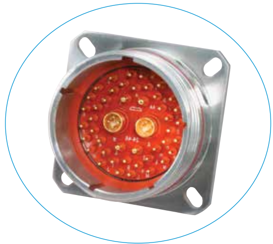
MIL-DTL-38999 Series III Connector with Twinax Contacts and Standard Contacts

A Short Profile size 8 Twinax is available that can be used with a low profile right angle backshell and can offer increased packaging efficiency. Consult Amphenol Aerospace for further information.