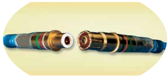
Concentric Twinax Contacts Size 8