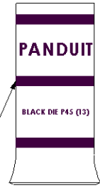
Color coded barrel markings