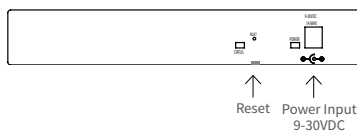
CONNECTPORT TS 4X4 - FRONT