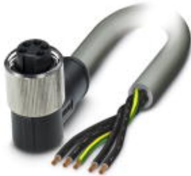
Power cable, 5-pos., gray PVC, 2.5 mm 2 , free cable end to angled 7/8" 16UNF socket, length: 1.5 m

Please be informed that the data shown in this PDF Document is generated from our Online Catalog. Please find the complete data in the user's documentation. Our General Terms of Use for Downloads are valid ( http://download.phoenixcontact.com )