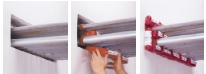
Conduit bank being firestopped.

3M Fire Barrier Pillows have been tested to the ASTM E 814 test criteria and have been designed to meet the intent of NEC, NFPA, SBCCI, BOCA and ICBO building codes.