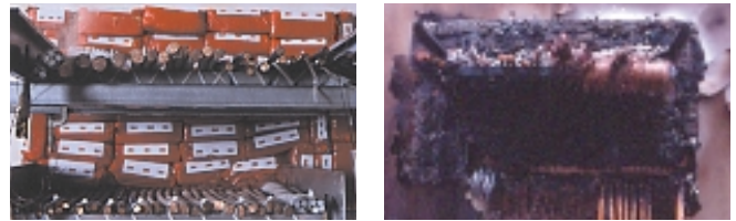
Firestopped cable tray before the fire.