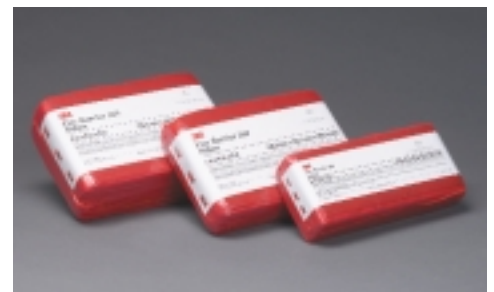
3M Fire Barrier Pillow family of products.