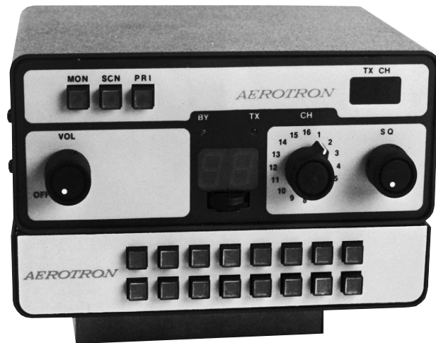
MML communications application. Mobile radio control keeps businesses in touch with employees on the road.