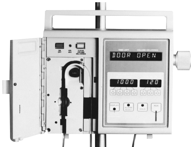
MML medical application. Intranvaneous fluid flow controller automatically dispenses fluids for medications, therapy, and nutrition.

MML91/93 Incandescent Lamps/Receptacles ..... 87/88