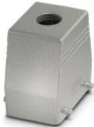
HEAVYCON sleeve housing D50, for double locking latch, height 76 mm, without support 1x M25, straight conductor exit

Please be informed that the data shown in this PDF Document is generated from our Online Catalog. Please find the complete data in the user's documentation. Our General Terms of Use for Downloads are valid ( http://phoenixcontact.com/download )