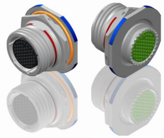
LAYOUT SHOWN AS EXAMPLE