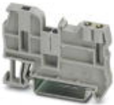
Screw flange, for screwing COMBI plugs, with the same structure and pitch as the relevant COMBI terminal blocks