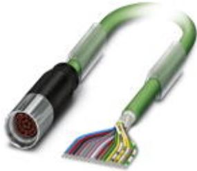
Cable plug in molded plastic, Length: 2 m, Color of outer sheath: green

Please be informed that the data shown in this PDF Document is generated from our Online Catalog. Please find the complete data in the user's documentation. Our General Terms of Use for Downloads are valid ( http://phoenixcontact.com/download )