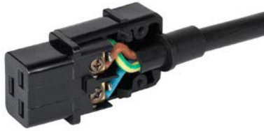
Example with assembled cable