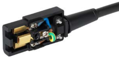
Example with assembled cable