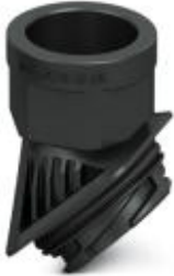
EVO plastic adapter with bayonet locking, for EVO housing series D, for Pg16 screw connections.

Please be informed that the data shown in this PDF Document is generated from our Online Catalog. Please find the complete data in the user's documentation. Our General Terms of Use for Downloads are valid ( http://phoenixcontact.com/download )