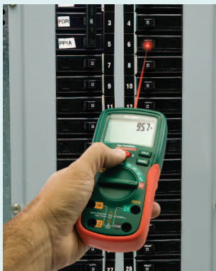
Built-in non-contact IR Thermometer quickly identifies hot spots on electrical panels