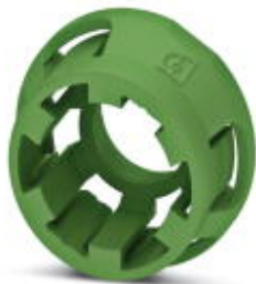
Fixing sleeve for M12 housing screw connection with tolerance-compensating function, for SMD-solderable M12 socket contact inserts.

Please be informed that the data shown in this PDF Document is generated from our Online Catalog. Please find the complete data in the user's documentation. Our General Terms of Use for Downloads are valid ( http://phoenixcontact.com/download )