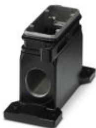
HEAVYCON B6 box mounting base, for screw locking, HPR series, with 2 x M25 gland, for increased environmental and EMC requirements

Please be informed that the data shown in this PDF Document is generated from our Online Catalog. Please find the complete data in the user's documentation. Our General Terms of Use for Downloads are valid ( http://phoenixcontact.com/download )